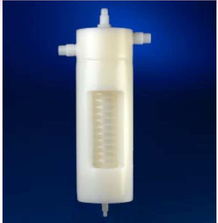
XC in-line heat exchanger (cutaway for illustrative purposes)

Note: Vacuum breakers are recommended for steam heating applications. Please consult factory for reduced pressure steam applications. Pulsation dampeners recommended.