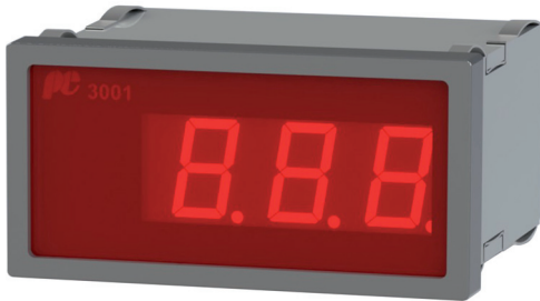
pe3001, front view