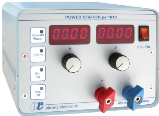
POWER STATION pe1010, front view

DC power supply linear controlled, designed for use in electroplating.