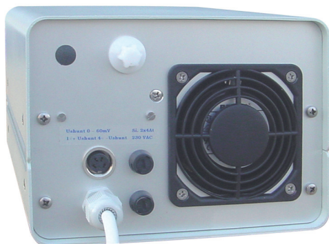
POWER STATION pe1010, back view