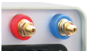
Back view DC lead through bolts