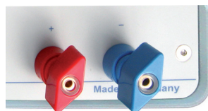
Front view DC oval flat clamp