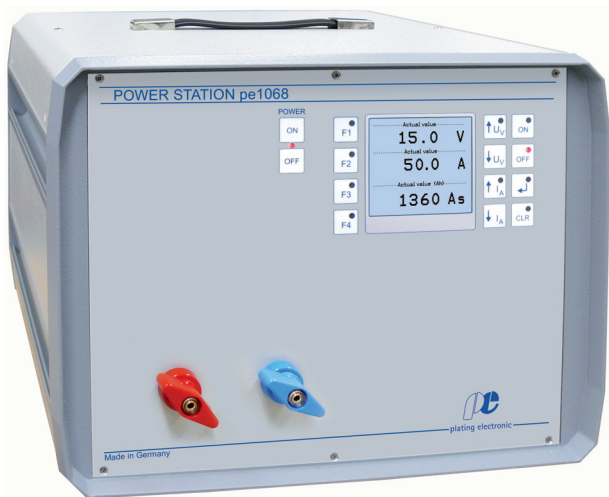
POWER STATION pe1068, front view

DC power supply in switch mode technology, designed for use in electroplating.