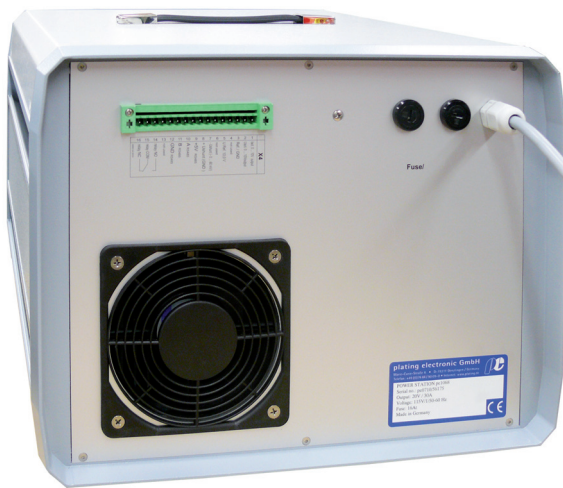
POWER STATION pe1068, back view